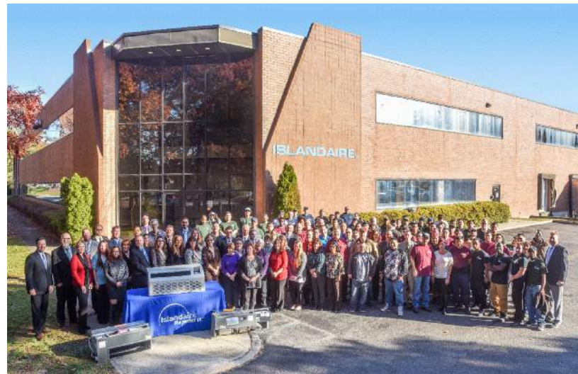
Our 75,000 square foot headquarters and manufacturing facility.