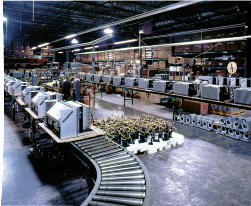
A partial view of our multi-station production line.

Located in our modern manufacturing facility, Islandaire builds a full complement of high quality thru-wall replacement air conditioners and heat pumps, water source heat pumps and gas fired heating units. Each model fits perfectly into the existing original wall sleeve assembly thereby saving both time and money during installations. Once installed, Islandaire cooling and heating units deliver dependable service at reduced operating costs.